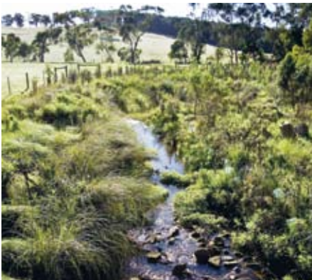
Fencing and revegetation works undertaken as part of the Stream Frontage Management Program.

As part of the Victorian Government's Our Water Our Future action plan, Melbourne Water's waterways and drainage boundary has been extended by more than 5,000 square kms to cover the majority of the Port Phillip and Westernport catchment.