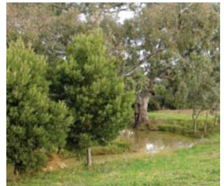
Toolern Creek, Melton Shire.

Melbourne Water has over 100 water quality monitoring sites across the Port Phillip and Westernport region. A new long-term water quality sampling site has been added within the Melton Shire. This will allow Melbourne Water to gather long-term data while also providing the opportunity to measure compliance with various standards, identify changes and trends over time, identify pollution sources and continue to inform the community about the health of local waterways.